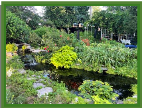
Backyard in 2023

Our meeting is on Tuesday, April 9, 7:00 p.m. at St. Mark's Episcopal Church, 2822 Frankfort Ave, Louisville, KY 40206, 38.254256, - 85.689458. St. Mark's is at the corner of Frankfort Avenue and Kennedy Ave. Please enter by way of the back door near the parking lot.