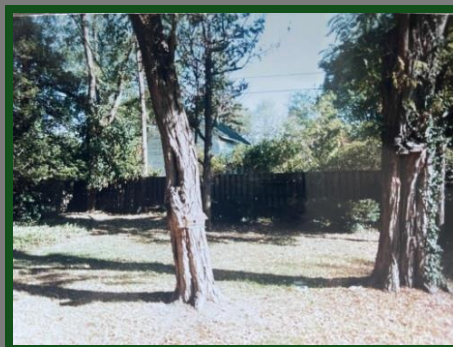
Her backyard in 1999